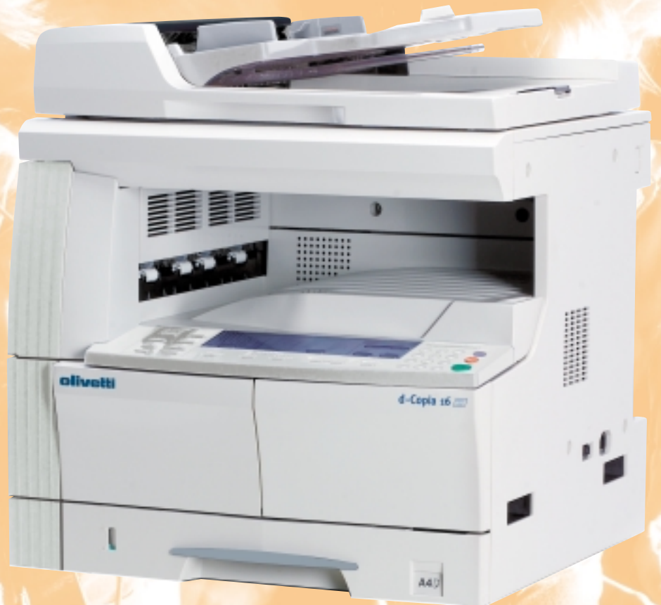
Olivetti d-Copia 16 Digital copier 16 cpm, A3 format

ergonomic console that can be operated without the user standing