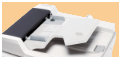
reversing document feeder with a capacity of up to 50 originals