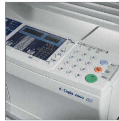
Easy-to-use OPERATOR PANEL for quick access to all digital functions