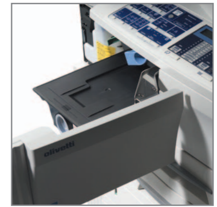
Long-life TONER CARTRIDGE (up to 15,000 A4 pages with 6% coverage)

Efficiency, reliability and cost-effectiveness are the distinctive features of these copiers. The Olivetti d-Copia 1600 and d-Copia 2000 digital copying systems use long-life accessories like a 150,000-copy Drum and 15,000-copy Toner to minimise print cost per page and extend maintenance cycles , for lower cost of ownership. By reducing the quantity of waste materials , these accessories also guarantee environment friendliness.