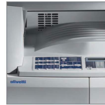
OUTPUT CAPACITY of up to 250 sheets face down