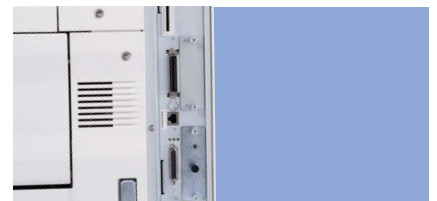
easy connection for multiuser environments