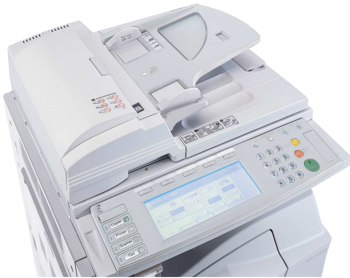
SRDF and duplex unit for back-front copying and printing