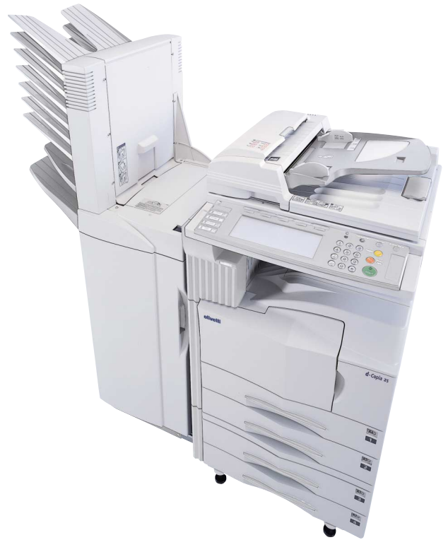
finisher for stapling and binding