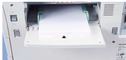
200-sheet bypass for increased flexibility