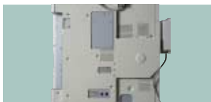
built-in 20 GB hard disk and SuperG3 fax connection