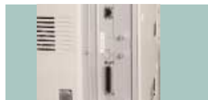
network interface and optional scanner/printer interfaces