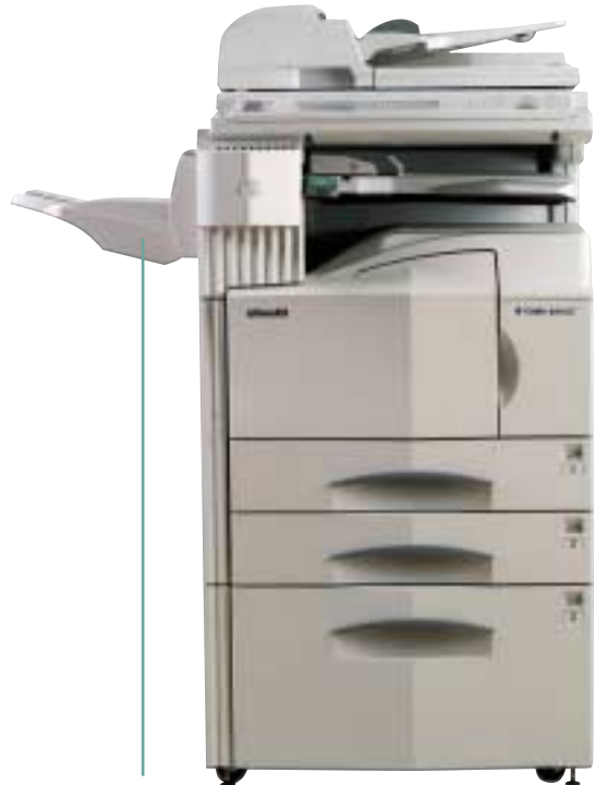
DF-78, an optional finisher that saves on costs and space